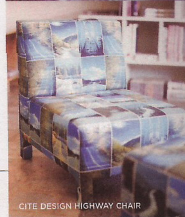
CITE DESIGN HIGHWAY CHAIR