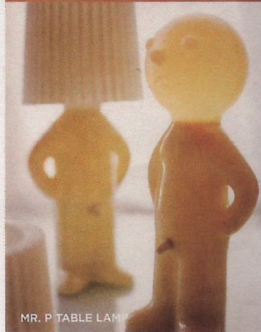
MR. P TABLE LAMP